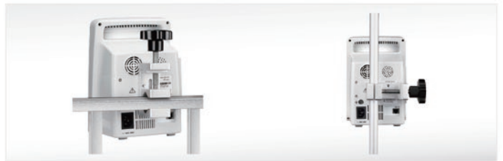
Bed Rail Clamp