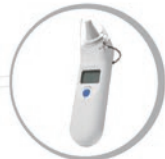
Infrared Ear Thermometer