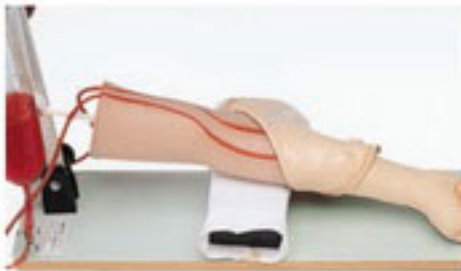
Replaceable outer skin and blood vessel tube.