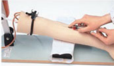
Needle injection has same feel as with a human arm.

A series of techniques such as confirmation of injection site, insertion hypodermic needle and injection of medicine are possible with this model. The pressurized blood vessel can be palpated, and needle insertion provides a feeling similar to that offered by a real human arm. Blood vessel tube is durable enough to be used in numerous practice injections.